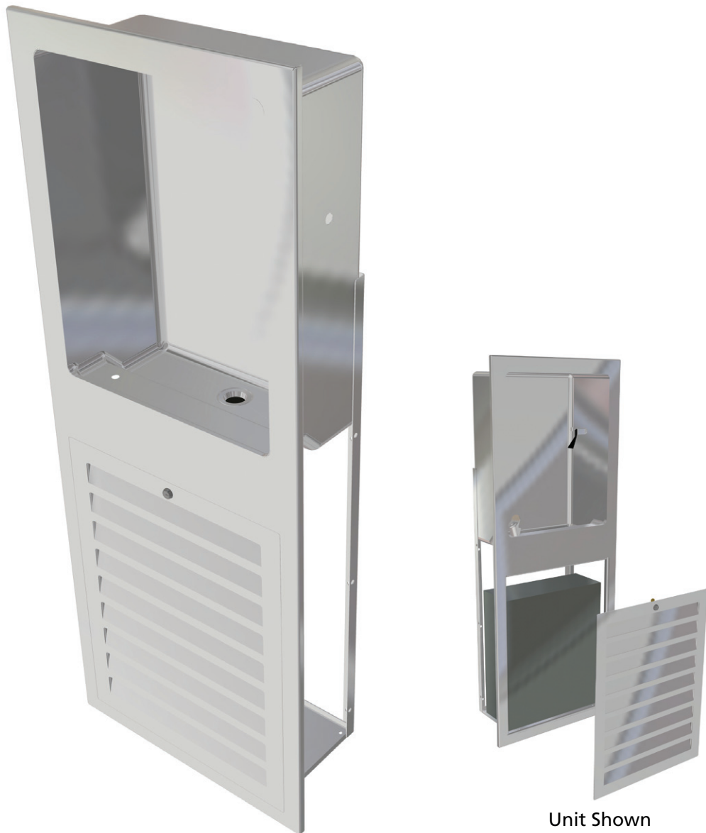
Unit Shown Fully Optioned