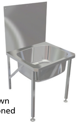
Unit Shown Fully Optioned